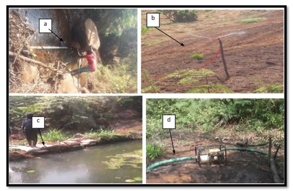
Figure 3: Show Different Methods of Irrigation Developed by Farmers