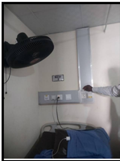
Figure 4: Images Showing Available Ventilation and Lighting Fixtures in a Two-Bed Ward in AM Ward