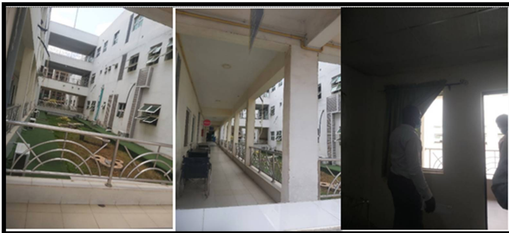
Figure 3: Images Showing the Courtyard Space Allowing Natural Light and Ventilation into the Wards

The 8 bedded wards have light natural coming into the space through two types of windows on opposing sides of the wall. One window type is used on the side opening into the exterior of the building, this type is a 'Top hung four-sided casement window' with a size of 1.8x1.5m. There are three in number positioned in-between every two beds on that side of the ward. This window provides direct natural ventilation and lighting into the space. On the opposite side of the wall, the window type engaged is the 'Sliding window' positioned on the wall on the walkway coming from the atrium space. The windows, two in number, provided minimal natural lighting and ventilation because it was positioned a bit away from the direct source. For protection against glare, blinds were used in this ward, which provides enough protection and allows the majority of air to flow into the space even when in use.