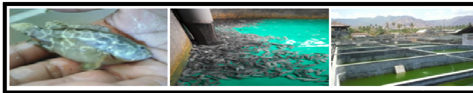
Figure 1: Photograph of Cantang Groupers in the Form of Seed or Juvenile

controlled biosecurity and integrated mariculture. Post-harvest ability: groupers are sent in a fresh condition of life using a plastic bag that is given enough oxygen and the fishes are fasted before being packaged. The delivery of grouper size consumption uses an aquarium that is transported to the Hong Kong ship berth. The grouper quality test includes: physical quality test, chemical and biological pollutant content, as well as fish taste test, unique taste and flavor elasticity. Human resources development conducted by government, private sector, NGOs and experienced farmers.