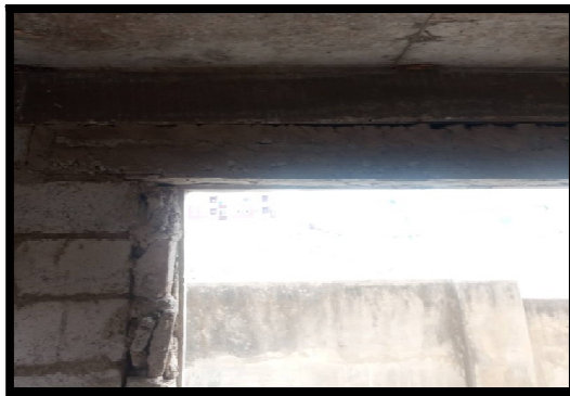
Figure 5: Sagging at Window Opening

Generally sagging demonstrates structural deficiency associated with the sagged member. Reasons leading to sagging could be (i) under reinforcement, (ii) use of inferior materials, (iii) construction of undersized member, (iv) poor workmanship, and (v) over loading. In this respect, it takes diligent and experience inventory experts to ascertain violation with regards to items (i) and (ii), evidently, items (iii), (iv) and (v) which were observed and confirmed.