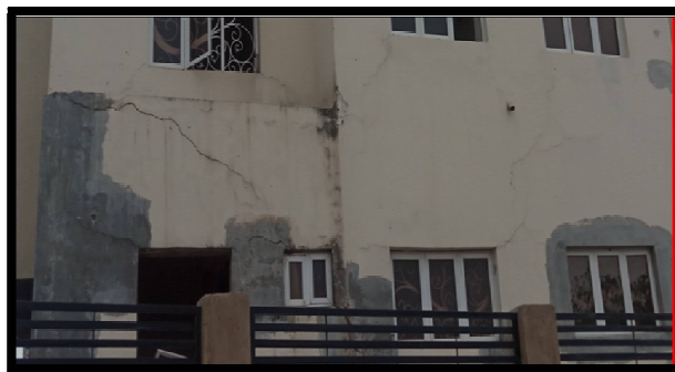
Figure 1: Diagonal Crack Resulting from Foundation Settlement

Figure 1 presents large diagonal crack ripping across the ground floor walls of the left side of the structure. The diagonal crack has wider opening at the top and smaller gap towards the bottom right which is a clear indication that the foundation under the left side has entertained some amount of settlement (sinkage). Foundation settlement, particularly when it affects some parts of the foundation, leaving the other parts unaffected (known as uneven settlement) will normally depicts cracks of the nature seen in the Figure below.