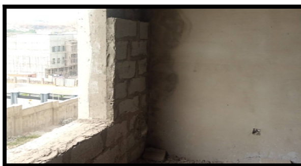
Figure 4: Increase in Wall Thickness through Cladding with Blocks

Building sway is definitely an eyesore to observers and more importantly scaring to occupants. A look from the tarred road passing in front of the 'Plot' in an axis parallel to the front side of the erected structure revealed some amount of sway particularly towards the end of the structure. It isn't surprising when the inventory team stumbled on what looks like cladding but using blocks, while in actual sense it is a way of making up a wall that has deviated from its bearing or real standing position. Figure 4 below presents increase in wall thickness using parts of locks.