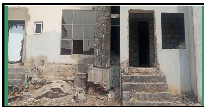
Figure 2: Footing Bases Composed of Loose Soil

Figure 2 below presents typical place where foundations were footed on loose soil at ground surface levels. The soil was found to be so soft that it can be removed using ordinary bare hand. This background doesn't look like a newly constructed structure.