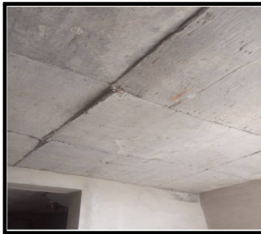
Figure 3: Soffit of Poorly Constructed Suspended Concrete Floor

Indeed, placing foundations on the surface of the ground or close to surface without digging proper trench could surely attract settlement especially where the ground is of vegetable soil nature. Another serious threat could be from lateral loading such as wind or storm forces. In fact, buildings or parts of the buildings whose foundations remain at surface or close to surface levels could entertain sway or complete uproot.