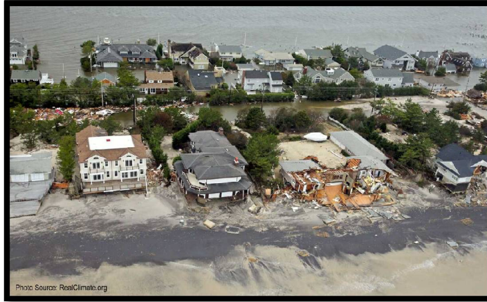
Figure 2: Coastal Flooding Caused by Hurricane Sandy Ravaged the Jersey Shore in October 2012