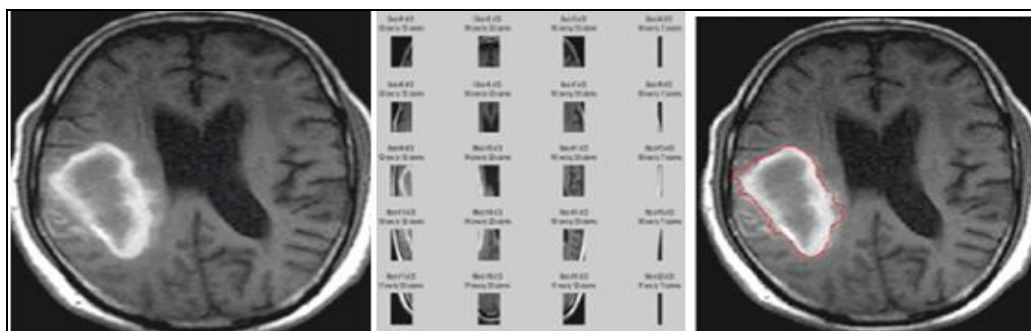
Figure 2: (a) original MRI (b) sub blocks of MRI (c) segmented tumor using SVM

Is segmented using adaboost SVM which is used to dete the location of the tumor?