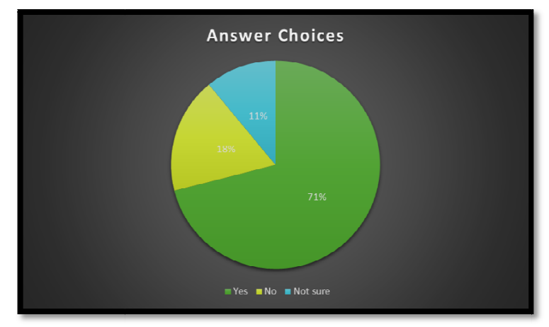
Figure 1: A Pie Chart Representing Answer Choices