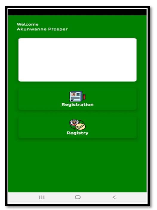
Figure 4: Homepage Implementation