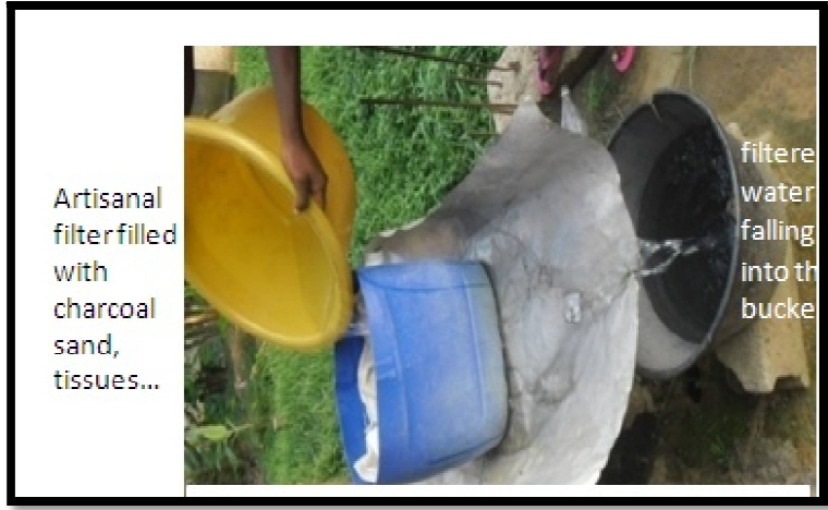
Figure 4: Well Water Filtration Source: Kah, 19th December 2012)Sodiko

Well water is used in all except for drinking and we allow it to settle. When the water becomes red, we filter it before using especially during serious dry season. Like now the water is changing a bit. We burst a plastic recipient, wash a large quantity of sand, we take a tissue of foam on top of the sand and another beneath the charcoal. It should be noted that the order of placing these items is not strictly respected. Despite all this, this method is not the best because when we boil water for fufu, dirt still settles on one side on the bottom of the pot. In Mambanda, it is worse, well water is red even during the rainy season. In our village, clean water must be clear. In addition, there are water sources that are not drinkable or even usable and visitors are advised not to do same. "Lehchianchi means clean water", "lehchia" means clean and "chi" means water in Bafang(Carole, Grand Hangar, 19th December 2012).