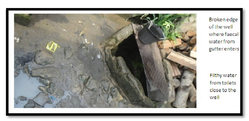
Figure 3: Broken Well Near Disposed Wastes Containing Excrements at Bepanda

If a witch or member of famla knows that Kendre lives in Nylon-Brazzaville fetching water from an unprotected well as the image below, he will pass through this risk to inflict an illness in the same line with this; so as to avoid the least suspicion. As Wafo says "We already know all of this; for a witch can pass through any means to inflict death on people, we don't take any death for granted". The phrase "we don't take any death for granted goes to any issue which concerns autopsy which we will glimpse later". What seems preoccupying is that the informant Wafo does not totally disagree with the biological notion of cholera. He does not also emphasize that all cases of cholera are associated to mystical origins. Perhaps, his position may be due to the fact that he has a certain degree of literacy (BTS) but other residents are of the fact that cholera is not an environmental problem but an invention of the witchcraft from this point of view.