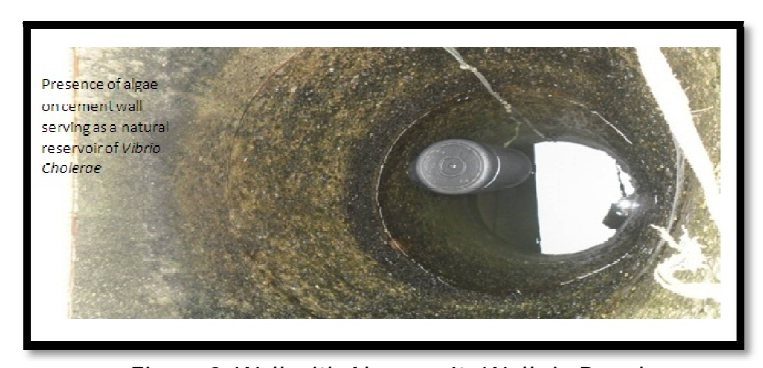
Figure 2: Well with Algae on Its Walls in Douala

Wells are the most used sources of water by the population of Douala. This city is said to have more than 70000 wells according to a study carried out by GTZ in this locality.