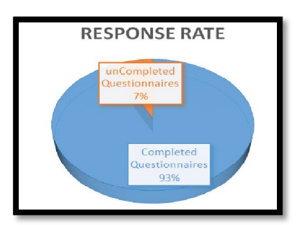
Figure 1: Response Rate

The sample population consisted of 96 employees who were all given a questionnaire to fill. 89 of these respondents completely filled the questionnaire and were collected after five (5) working days. This represented 93% response rate which according to Mugenda and Mugenda (2009) is an excellent response rate.