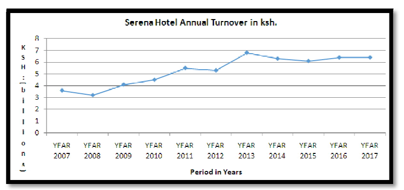
Figure 2: Annual Turnover for Serena Hotels

Figure 2 above shows that the Company recorded a turnover of KShs. 3.24 billion, a decline of 11.7% from the 3.67 recorded in 2007. However, during the first half of 2008 the tourism industry in East Africa encountered various serious challenges as a result of the post-election crisis in Kenya which led to massive cancellations of bookings to Kenya and, to a lesser extent, to Tanzania and Zanzibar too. Arrivals to Kenya dropped by approximately 32% in 2008 compared to 2007 causing a reduction of 24% decline in the number of bed nights at Serena hotel. The crises also caused a considerable slowdown on Kenya's corporate sector with a negative impact on business levels on local markets, particularly Kenyan operations. Other factors which contributed to low business operation includes the recession in many world economies in 2008 and the volatile cost of fuel which caused a ripple effect of increased prices for most commodities worldwide especially food and included travel and in particular air fares.