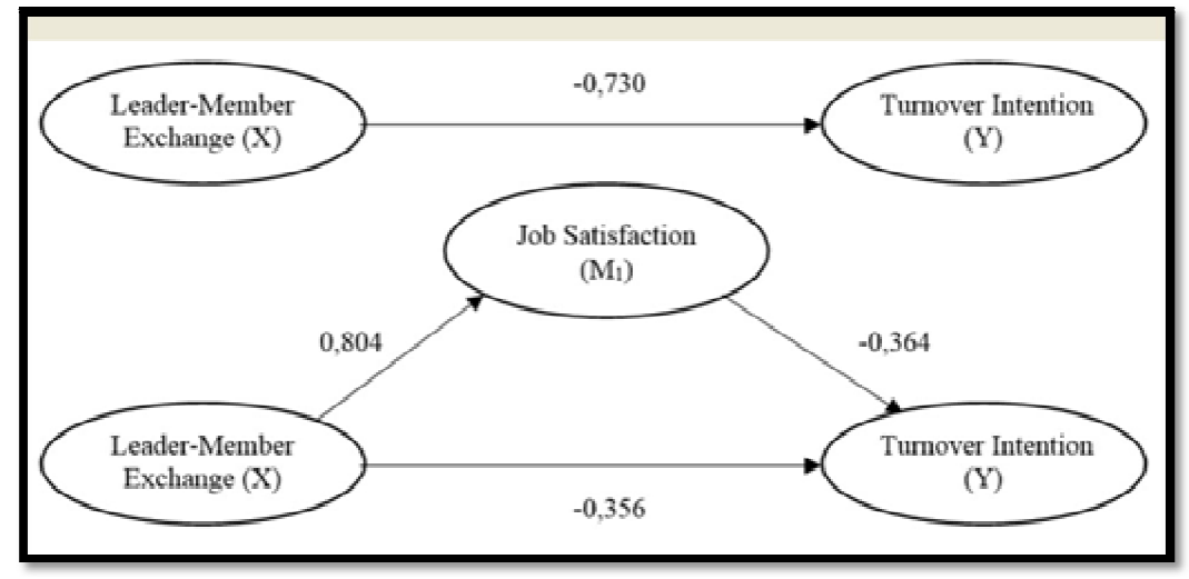
Figure 2: Mediation Test of Job Satisfaction

The result of mediation test with VAF method has fulfilled several requirements, namely, first, direct influence (e) leader-member exchange (X) variable to turnover intention (Y) without involving organizational commitment mediation (M2) variable in model has been found significant. Second, after organizational commitment variable (M2) is incorporated into the model, the indirect effect (f x g) is found to be significant. Paths f and g are also significant. Third, calculate Variance Accounted For (VAF) with the formula: