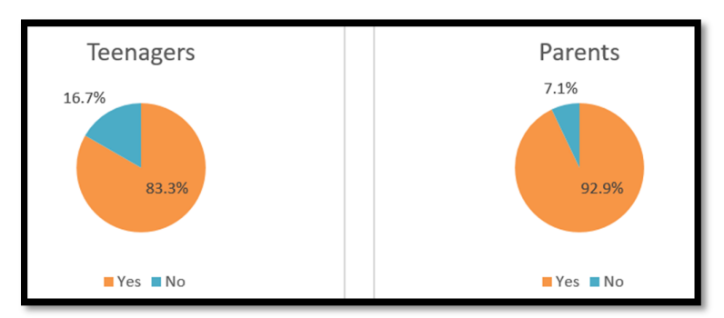
Figure 1: Do You Have a Mobile Phone?

According to the data gathered, the majority of teenagers (83.3%) and parents have their own mobile phones (92.9%). However, a few teenagers (16.7%) and parents (7.1%) do not own a mobile phone.