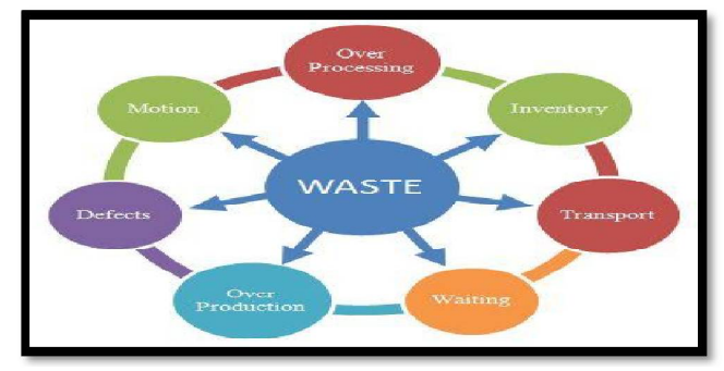
Figure 1: Non-Value Activities

Ineffective materials management practices have adverse impact on project cost, contractor's profit margin, project duration, and can be a possible source of dispute among parties involved in the project. Therefore, inefficiencies associated with conventional practices of materials management in SME often the root cause of project performance [2]. Therefore, conventional materials management practices have failed, which affects most SME construction firms project's performance in Nigeria directly or indirectly. [16] asserts that, reluctance to adopt new innovation of managing resources in this era of technologies pose a challenge in the face of SME's projects performance resulting to waste generations. The consequences of materials waste are enormous because materials account for about 55% to 65% of the project cost. This indicates need for new way of managing materials in order to avoid its generation and improve SME's performance. Fig. 1 presents the non-value activities resulting to waste generation.