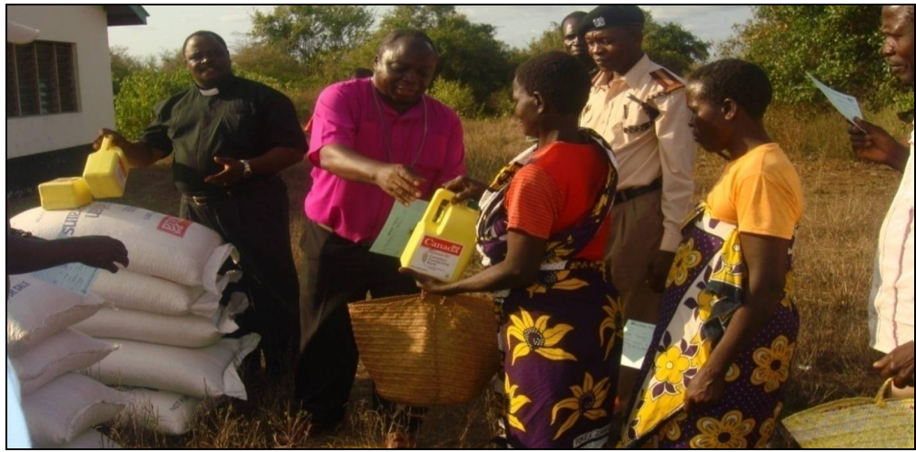
Figure 4: Distribution of relief Food at Tsangalaweni in Kilifi County (Field data, 2014)

The procurement processes and procedures were cited as standard by all 36 (100%) of the CFBOs employee respondents. This was in agreement with the interview schedule with the directors of the CFBOs who informed the study that all the procedures of procurement are always followed religiously and standards are always a priority in all the activities. All 36 (100%) of the CFBOs employees' respondents cited lack of enough storage and transportation facilities of relief food.