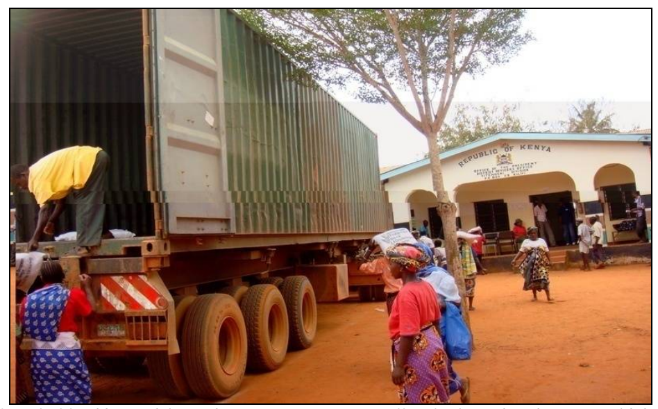
Figure 2: Relief food being delivered at Vitengeni Division office for later distribution (Field data, 2014)

"....During Government relief provision, village elders need more food for themselves or else they steal but FBOs are effective since they are people of faith......" (Field data, 2014).