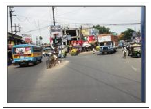
Figure 7: Champadali More

Problem: Narrow width of the road, congestion, encroachment, traffic jam. The N.H-35 runs across within Barasat Municipality with its two lanes. Nevertheless, these two lanes are converted into single lanes due to encroachment. However, the carriage capacity is not fulfill their requirements. Immigrant and out-migrant of Barasat Railway Station and Barasat Titumir Bus Stand are still waiting for their buses in Champadali more. Because of it, the buses are still waiting for their passenger into the Champadali more and they take more time to fill up it. So, they stand on the N.H-35 and cause jamming situation. The Auto and Van –rickshaw are also standing on N.H-35 for the passenger of station as well as Champadali More. However, the situation is that there are more than 30 taxis are still standing on this N.H. For this the there was a traffic conflict with regional traffic and city traffic and causing traffic congestion.