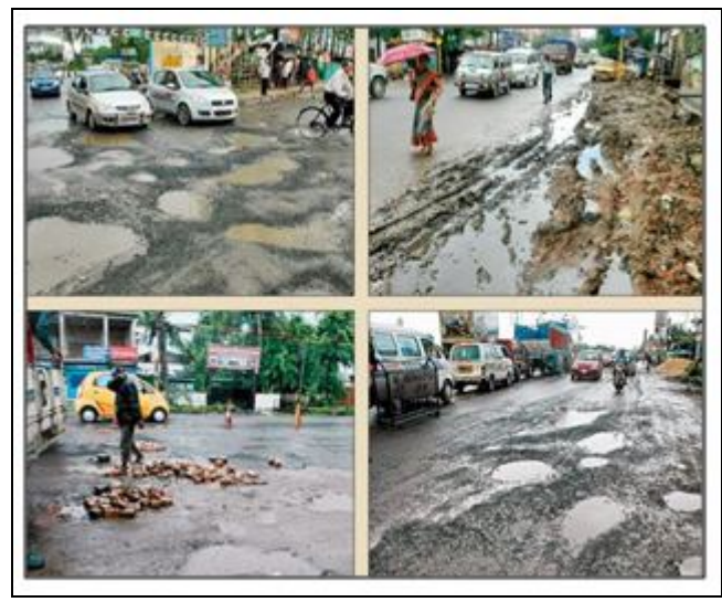
Figure 8: Bad Condition of road suface